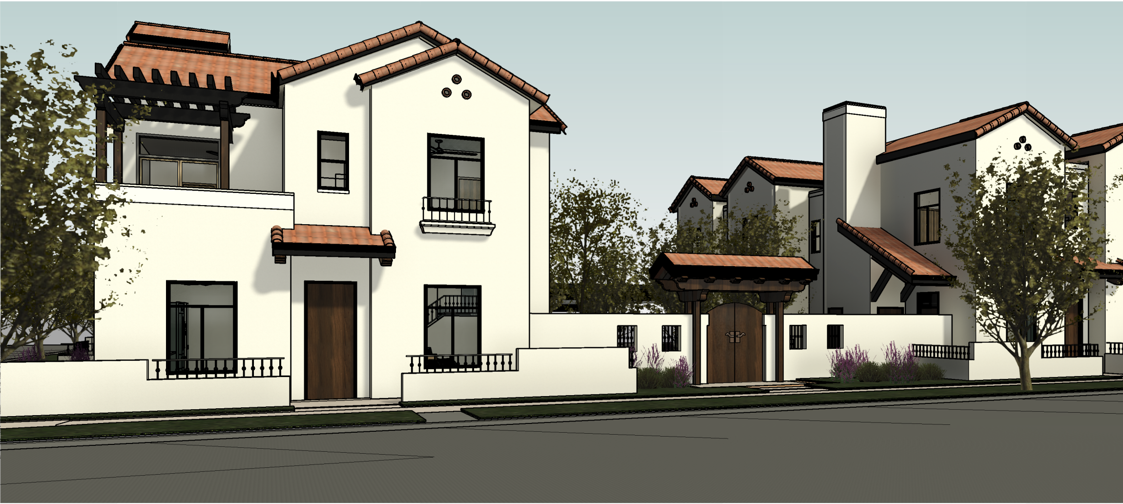
4TH STREET ENTRY GATE